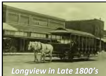
Longview in Late 1800's